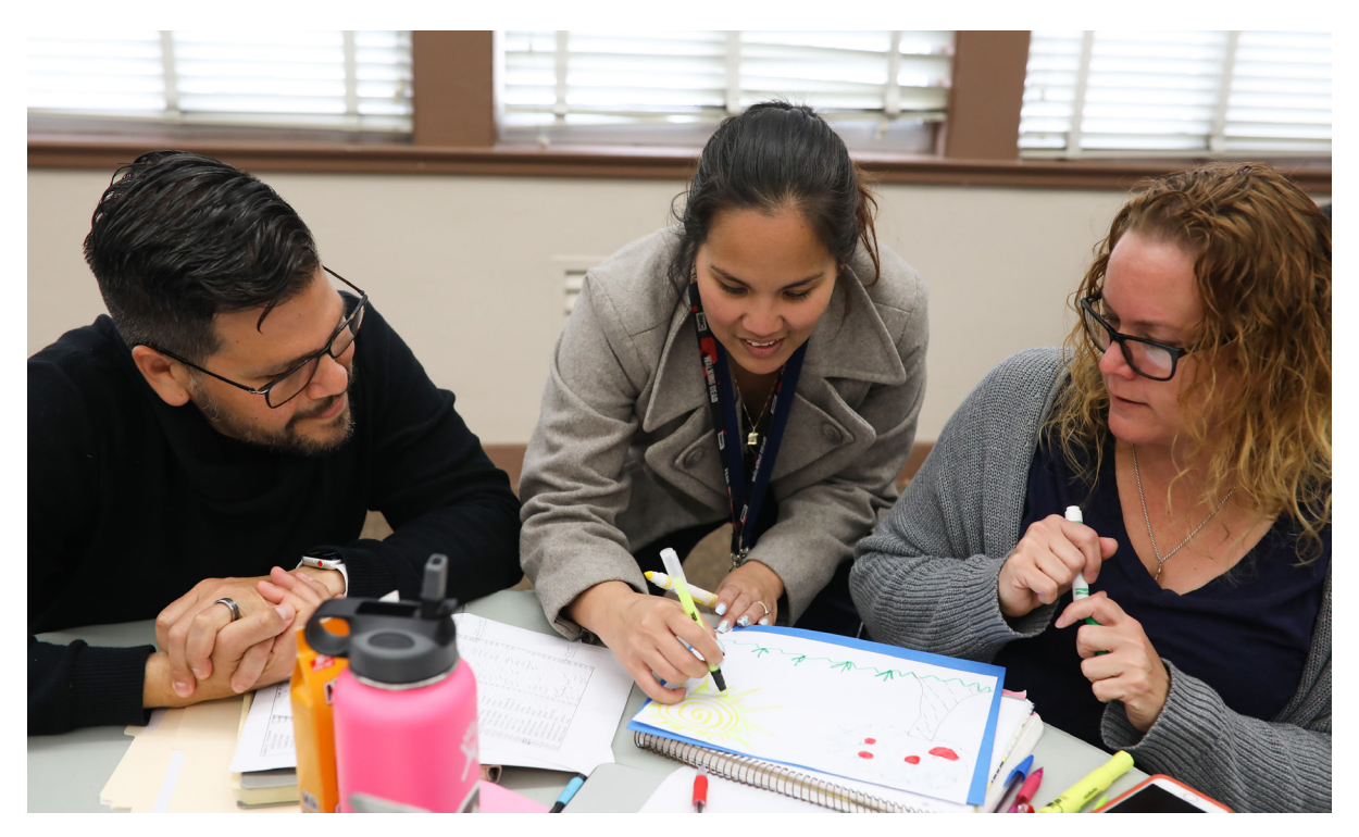
Equity Leader Lab participants collaborate in school groups to plan next year's activities that will sustain the equity momentum in each school. (May 2019)

In the second year of EOS's work with a school, as a more diverse group of students enters AP/IB courses, teachers use the insight cards as a reference point to connect with these students on a personal level and support them to address barriers they may be facing. "When teachers finally receive their students' first semester grades, that can be powerful" says Kay. "A number of teachers come around in their predictions that some students will fail or struggle."