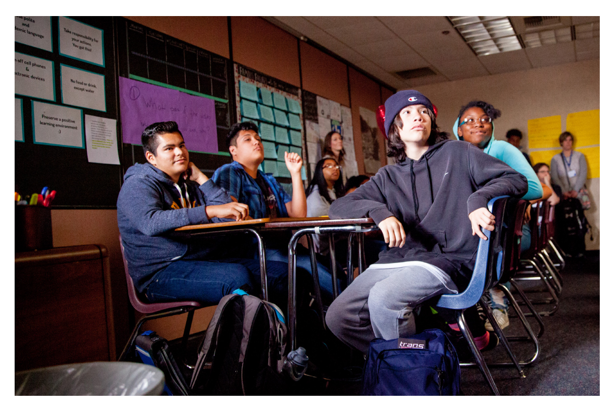
Students share their lollipop moment with conference attendees.

That more complete view of students takes shape in weekly team meetings, called block time, where teachers share observations of each student's strengths and challenges. Block time centers on what Jerabek calls one of the BARR model's "defining pillars": real-time data. The team works off a spreadsheet that builds a picture of each student by reviewing a variety of in-school factors, including progress in class, attendance, and behavior. The team also discusses factors outside the school, such as extracurricular interests, personal health, issues with other students, or troubles at home. All this data collection allows the team to flag challenges early and work together to solve problems. Importantly, teachers track not just problems but student strengths to identify achievable goals to get or keep students on track for success. "In every aspect of the model, from the frame itself, down to the day-to-day operations, the first question every teacher has to answer is, 'What is the student's strength?'" says Jerabek.