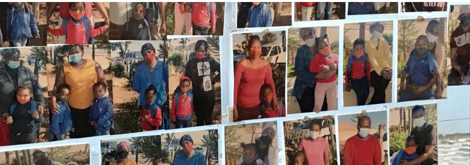
Photos of students and their parents/caretakers are on display as a source of motivation at Ubuntu School.