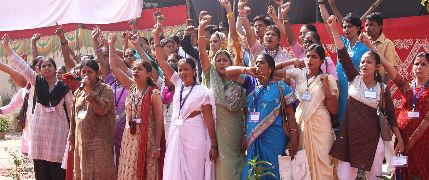
The first group of graduates from CORO's Grassroots Leadership Development Programme celebrate their graduation day in 2009.