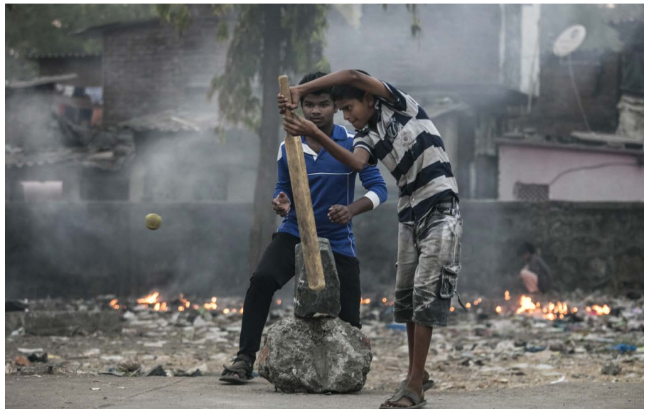
Children at play in Lallubhai Compound, Mankhurd, Mumbai.

Nevertheless, we have seen how easily overstretched NGOs can attend to those who stand the best chance of improving their lives while neglecting those who face the longest odds. YUVA counteracts that tendency by deliberately seeking out those