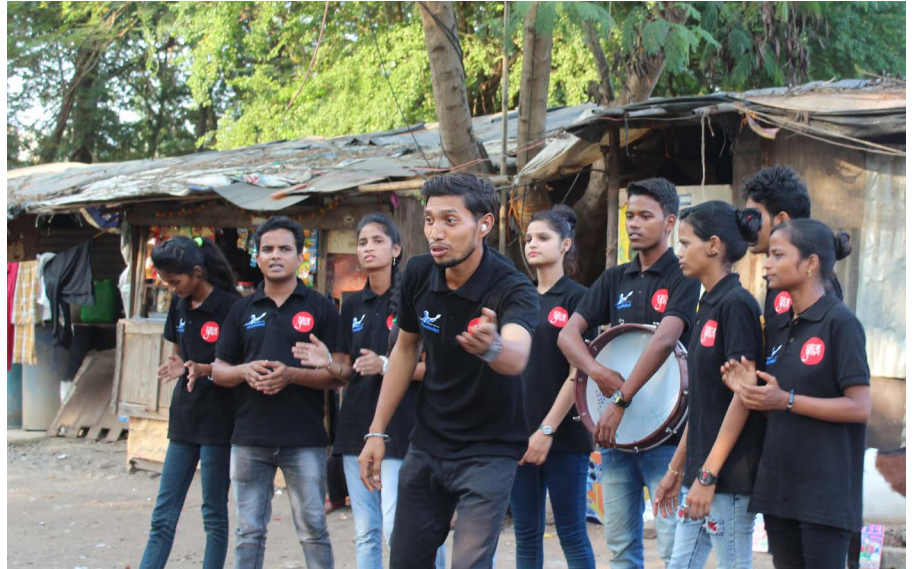
Malwani Yuva Parishad youth collective members present a street play in Mumbai.

The Malwani YUVA Parishad (MYP), a YUVA-facilitated youth collective, created safe spaces for young people to learn from one another to determine the course of their own lives through collective action. It has not only given them power as individuals, but also helped them drive change at the community level. Their community-based interaction and performances focused on controlling drug abuse, advocating for a gender-just society, and promoting religious tolerance and harmony have already reached over 5,000 people.