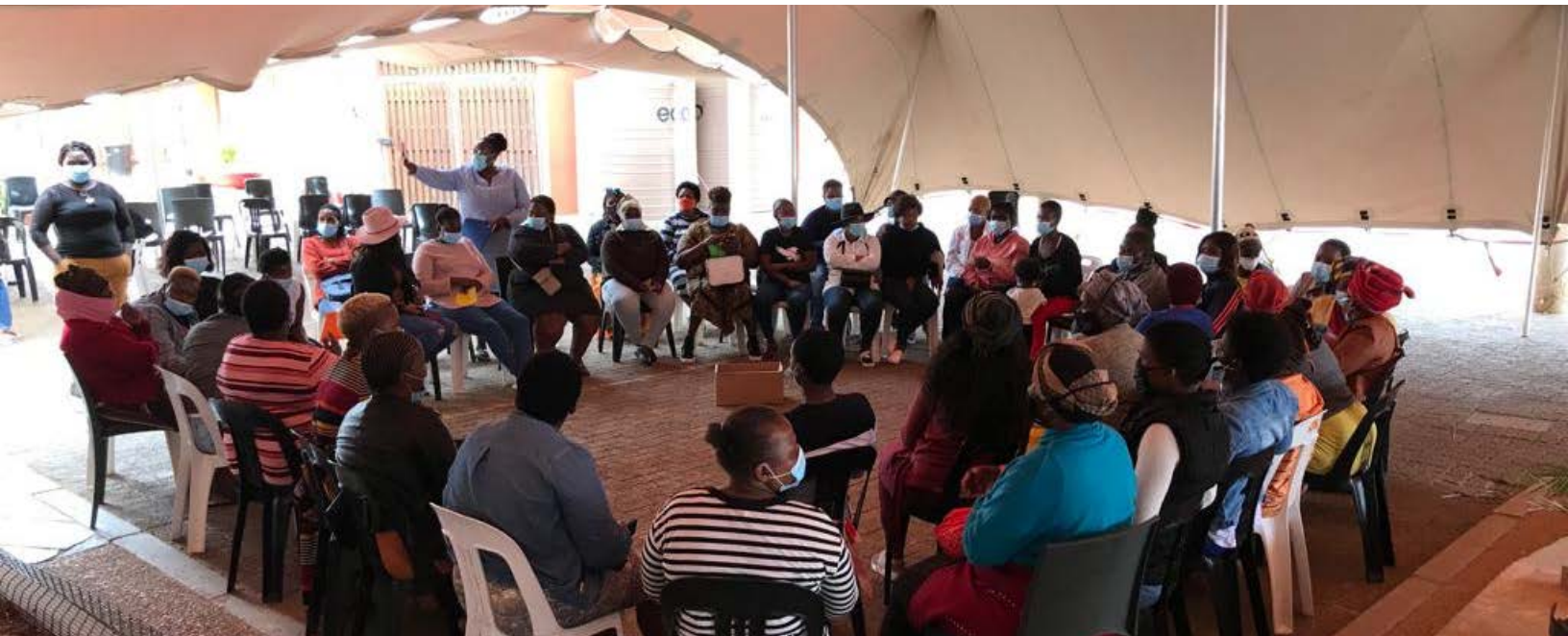
Parents of students enrolled in the Ubuntu School gather at Ubuntu Pathway’s site in Gqeberha, South Africa.

Each piece of the model came from a similar, community-driven revelation. In addition to partnering with the community on HIV/AIDS awareness campaigns, UP launched a programme to eliminate the transmission of HIV from infected pregnant women to their babies. It also built a state-of-the-art, primary and preventative healthcare facility.