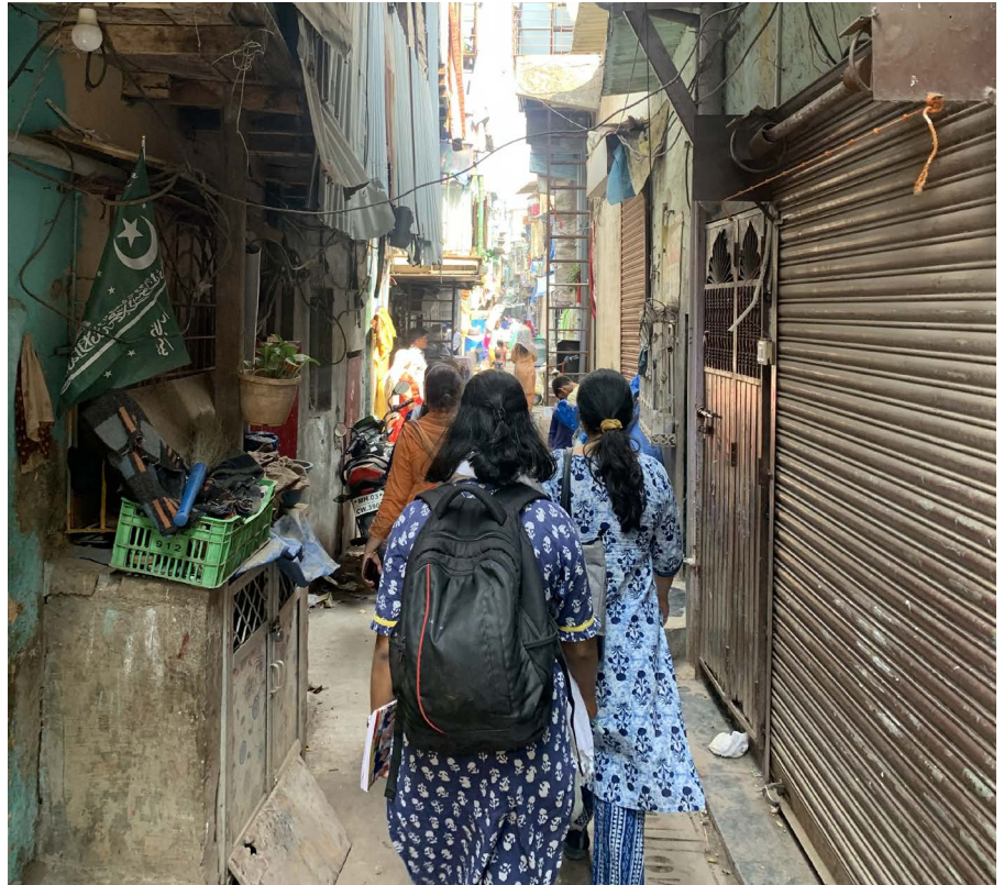
Bridgespan's team walks through a CORO site with community leaders in Chembur, Mumbai.

By continually chipping away at the problem, MMF has emboldened community members to openly discuss the effects of domestic violence, strategies for preventing it, and ways to report it. The result: in the past five years, MMF has worked with 14,500 households, built a network of 4,500 active members prepared to intervene at the community level, and dealt with more than 5,000 cases of domestic violence.