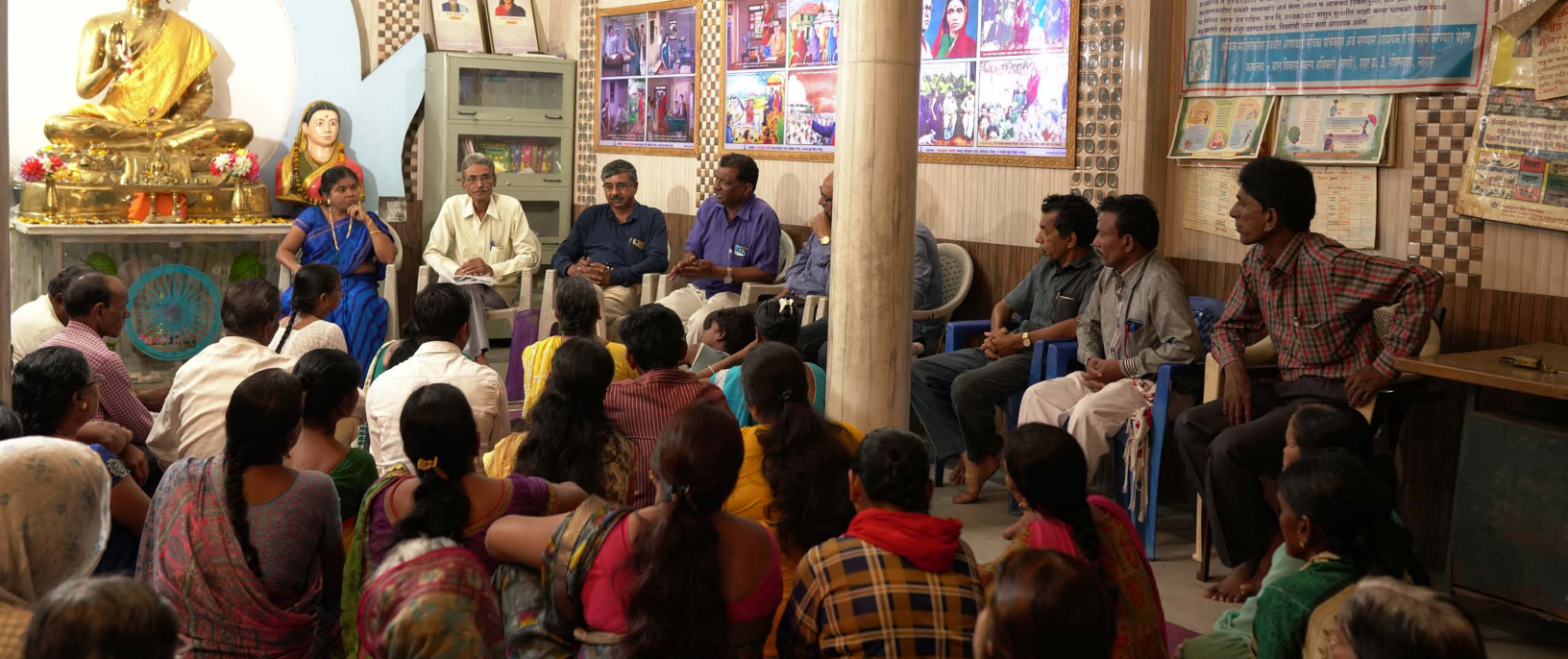
Sheher Vikas Manch people's organisation anchors a mohalla sabha with community members in Nagpur.