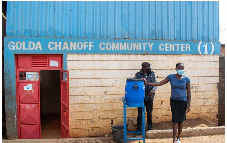
One of SHOFCO’S Water, Sanitation, and Hygiene (WASH) stations in Kibera, Nairobi, Kenya.

SHOFCO is largely comprised of the people it serves. It has deep relationships with an expansive network of 1.2 million residents of urban informal settlements. SHOFCO puts community members first and backs them through direct services, community advocacy platforms, and education and leadership development for girls. As such, the organisation has woven together tight bands of trust across the urban informal settlements it serves. Thus, the NGO was able to organise a rapid response to the COVID-19 crisis.