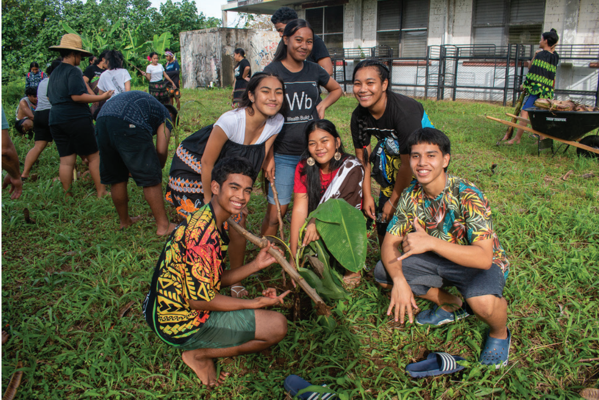
Indigenous youth from Micronesia’s Laudato Si’ Club, a Global Greengrants Fund grantee partner, plant banana trees to improve environmental conditions in their local community.