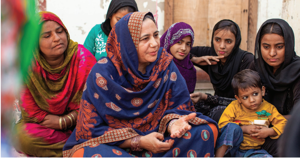
Members of the Home-Based Women Workers Federation, Sindh Province, Pakistan.

funds focused on gender equity could deploy approximately 10 times their current funding. 11 Prospera members can fund only approximately 15 percent of their eligible yearly applications.