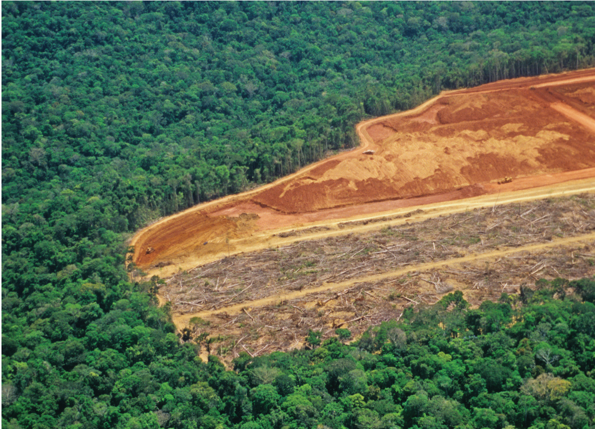
Fundo Casa Socioambiental has made grants to 300 associations in Brazil to defend the Amazon's forests and the Indigenous communities living there.