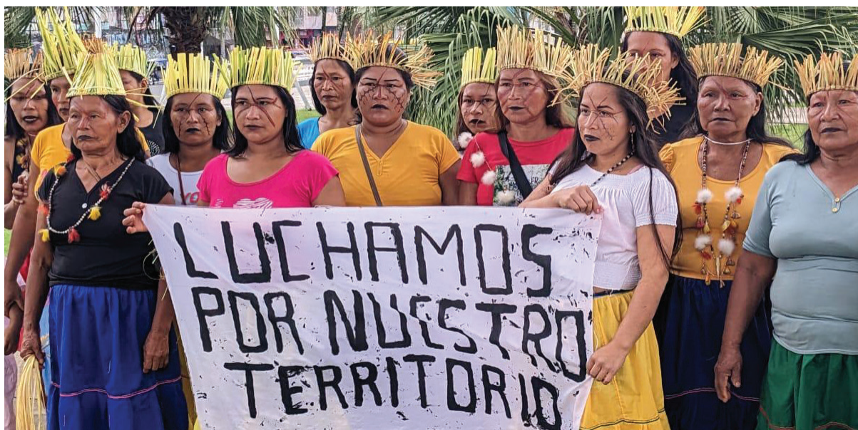
Indigenous women in Peru demand respect for their territorial rights during an event organized by Global Greengrants Fund grantee partner Organización Indígena Siekopai del Perú.

Many of our interviewees pointed out the potential of working at the intersection of climate and gender and cautioned against funders’ tendency to think in rigid issue categories. “Greengrants and Prospera have jointly invested at the intersection of gender and the environment for 10 years because of the silos happening in the philanthropic