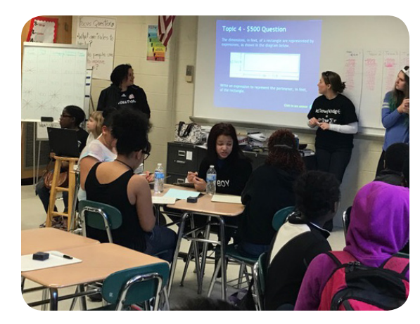
The seventh grade students at Empowerment Academies match wits.

In recent years, the school district has produced some of the lowest academic outcomes in the state. But that picture is changing, due to the innovative efforts of the Springfield Empowerment Zone Partnership (SEZP), a collaboration of the SPS, the Springfield Education Association (SEA), and the Massachusetts Department of Elementary and Secondary Education.